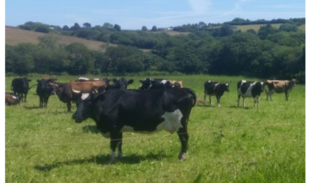
Cows at grass.

Several studies in SusCatt monitored the balance of fatty acids in different types of milk and beef, including from low-input systems where cattle eat nothing but forage (as nature