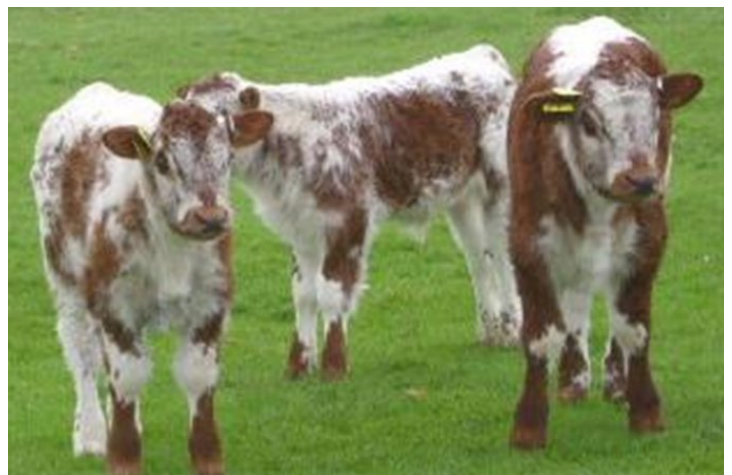
Beef cattle at grass.