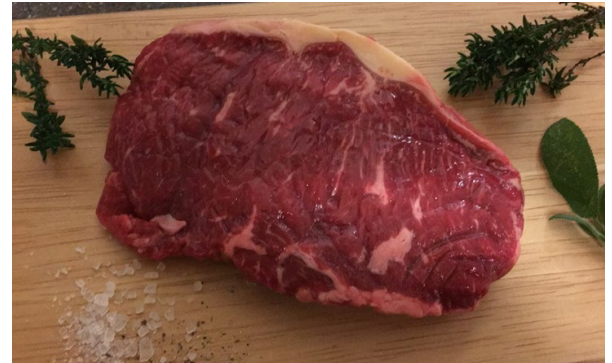
Sirloin steak.

By comparing meat composition from different production systems, we know feeding cereals or cereal by-products to cattle diminishes n-3 and increases n-6 in meat but there is little evidence from cattle fed only for-